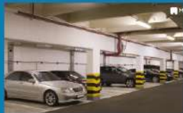
COVERED CAR PARKING